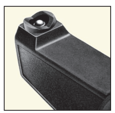
Carbide measuring probe for long life.