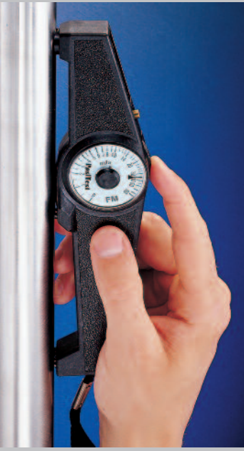
Stable design with additional tail-end support. No annoying rocking during measurement.